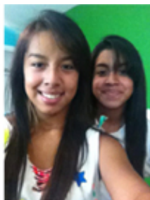
Must be alone in pict