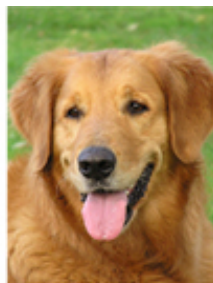
Must be human